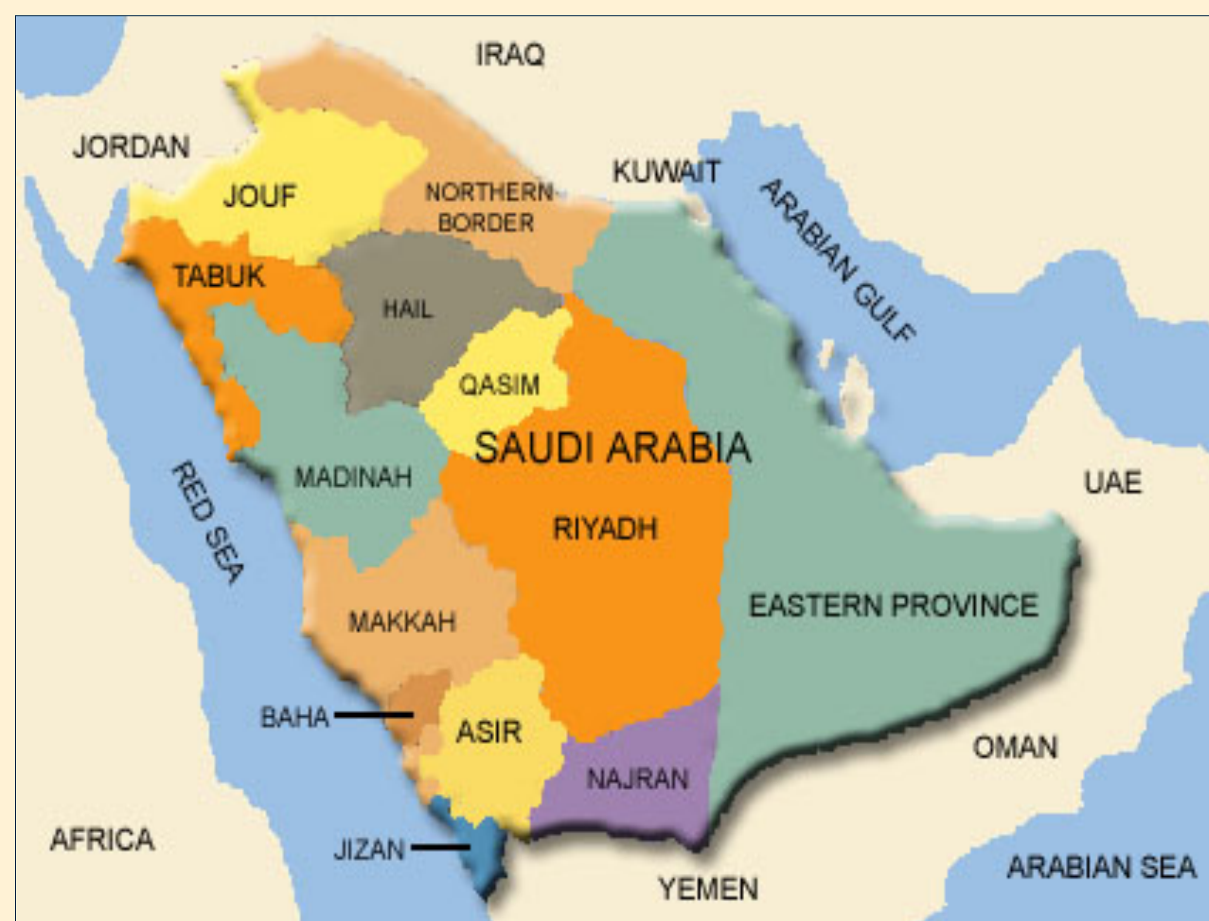
Figure 1. Administrative Regions of Saudi Arabia