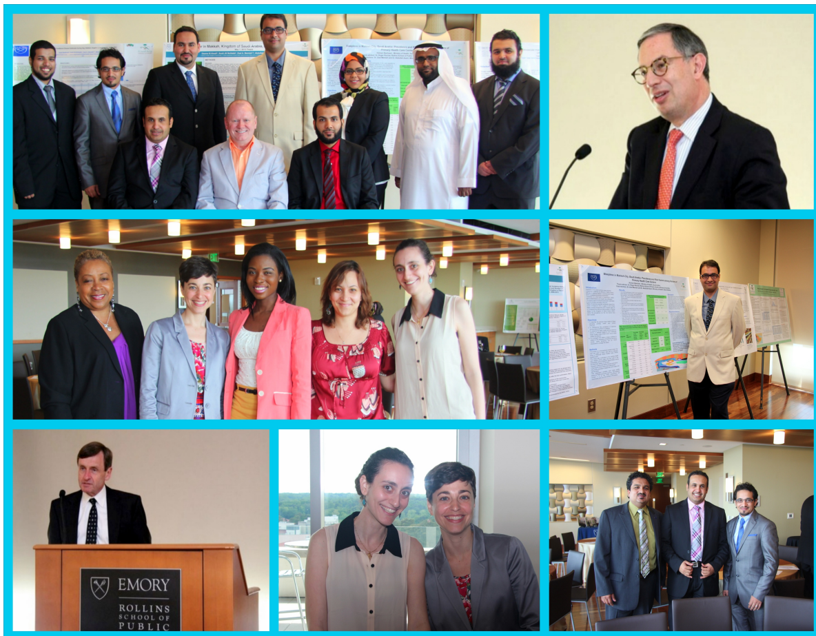
Photo: 2013 KAF Graduation Reception