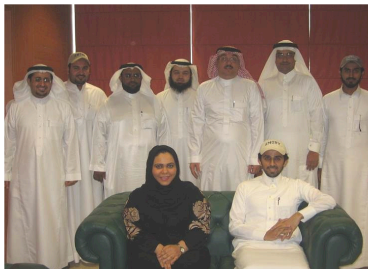
2011 KAFP Candidates